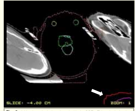
Fig. 3. A Vendor submission viewed with the RRT. This submission has several parameters with incorrect values. The incorrect parameters include (at least) the number of columns in the CT scan, the X offset of the dose array, and the Y offset of the dose array. (Dose is only visible in the lower right corner of the display).

Efforts to facilitate the export of ATC-compliant DICOM RT data from commercial TPS have established the collection and evaluation of volumetric imaging and treatment planning data as an essential tool for QA of advanced technology clinical trials. The ITC is now contributing its experience to the ASTRO IHE-RO initiative (Integrating the Healthcare Environment – Radiation Oncology). This cooperative effort involving both clinicians and equipment vendors is expected to further benefit clinical trials by increasing the interoperability of TPS components and the uniformity of DICOM RT objects they produce.